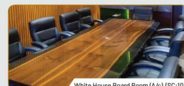
White House Board Room (A/c) (SC:10)